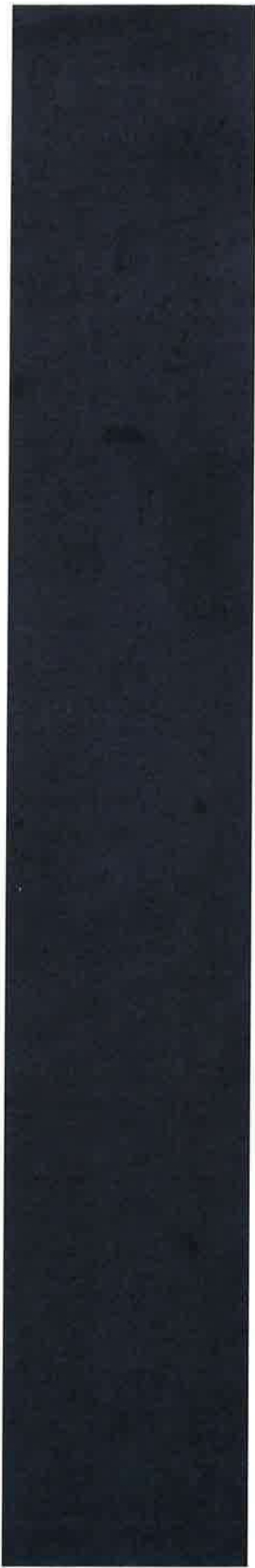
Exhibit M: Sample Special Connection Fee Calculation