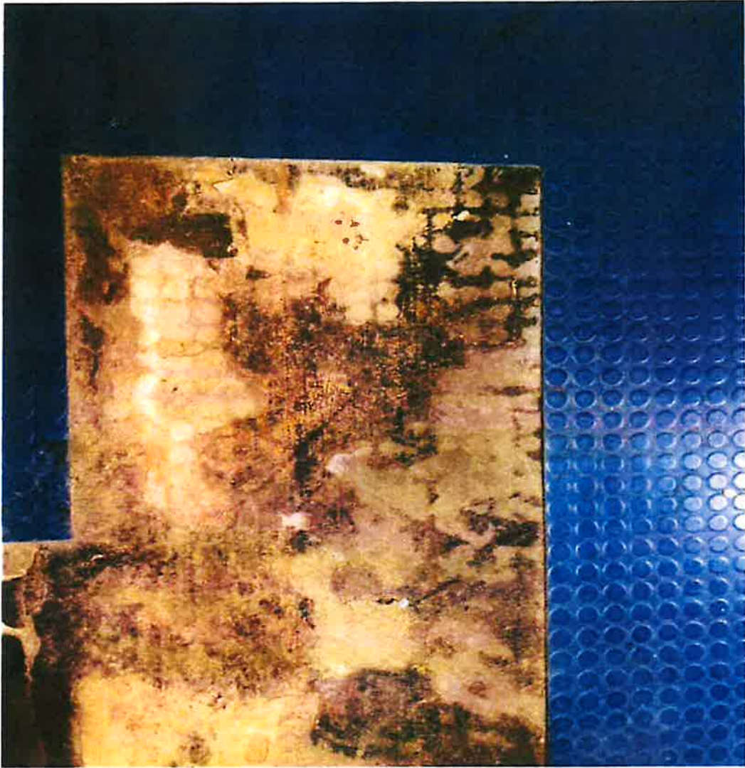
Sample Areas FT-1 and SV-1, Floor Tile Mastic and Blue Sheet Vinyl. Black Mastic Tested Positive for Asbestos.